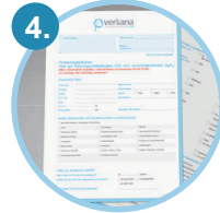
1 sample submission form