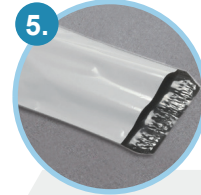
1 return envelope