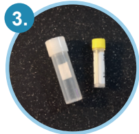
1 urine sample tube and 1 protective carrying vacuum-sealed sleeve