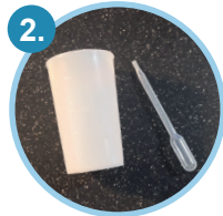
1 urine collection beaker and 1 transfer pipette